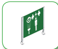
High visibility sign