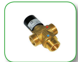
Thermostatic mixing valve to regulate shower temperature.