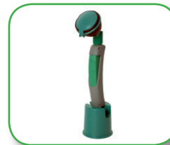
Single eye wash on flexible hose