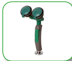
Twin eye wash on flexible hose

The basic shower unit can be fitted with an integrated eye wash unit. This eye wash will operate independently of the main shower and is suitable for minor spills or splashes where a full body shower would not be appropriate. There are several different styles of eye wash to choose from.